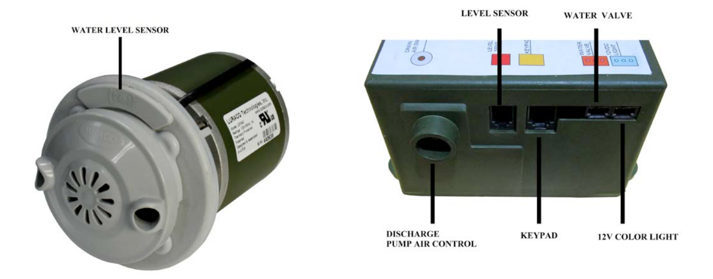
Fig. 2: Capacitive sensor installed on JET Housing