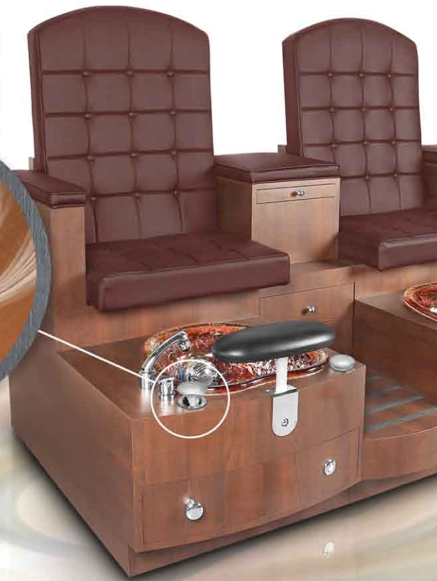
GULFSTREAM Air Vent System Adjustable