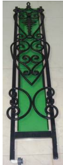
F. Rock Trays (2)