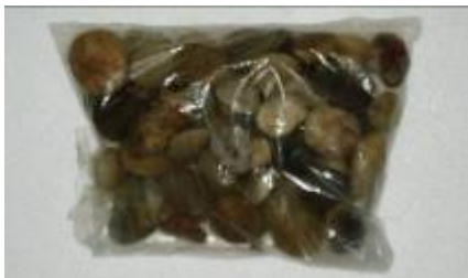
D. Bag of River Rocks (1)